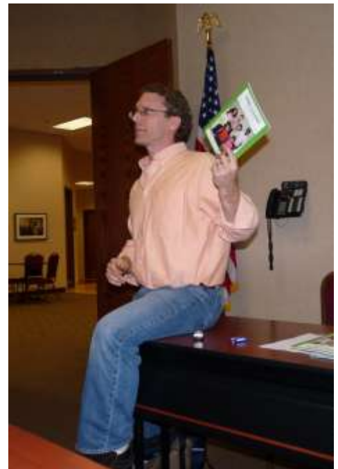
A representative of the Healthy Schools Campaign uses a copy of The Quick & Easy Guide to Green Cleaning in Schools to make a point. Custodial and maintenance efforts to clean our schools are more about student and staff health than tidying up. The April 20 House of Representatives presentation noted that the AFT is among the campaign's founding organizations and that Illinois was the second state to require green cleaning. Council officers and representatives present at the meeting were provided a DVD explaining the program. Information about the Healthy Schools Campaign is also at www.greenschools.org .