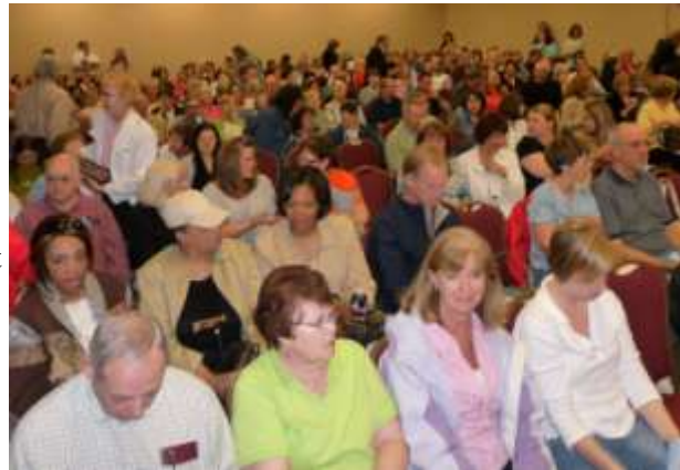
West Suburban Teachers Union and American Federation of State, County, and Municipal Employees (AFSCME) members and guests pack the Robert M. Healey Conference Center for the Legislative Forum on May 4. For details, see page 2.