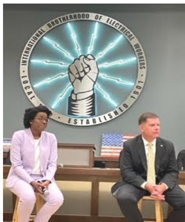
Congresswoman Lauren Underwood, CD 14, and U.S. Secretary of Labor, Marty Walsh, held a town hall in Batavia on August 24 at IBEW 196.