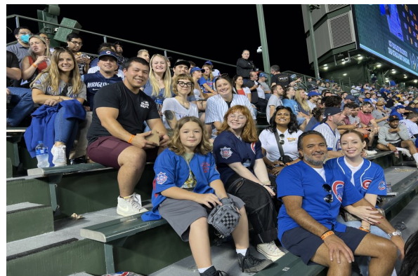
Franklin Park Council Members at Wrigley Field