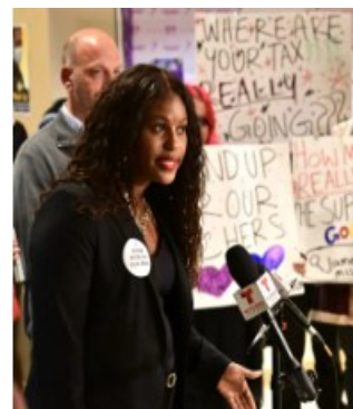
D209 teachers not fired but tensions still hot - Forest Park Review